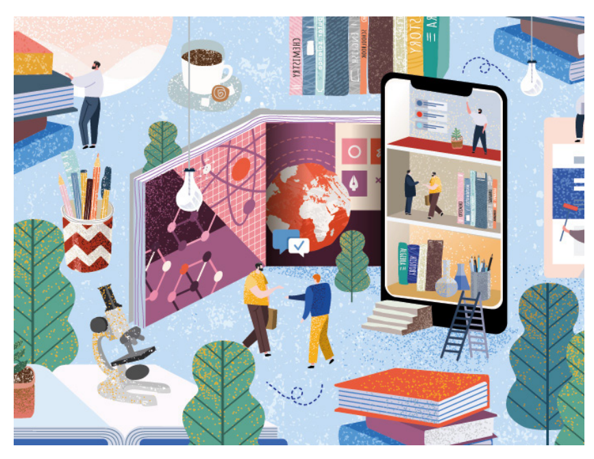
The Austrian Academy of Sciences and the Leopoldina invited discussions at the Joint Academy in Vienna/Austria.

Joint Academy Day with Austrian Academy of Sciences