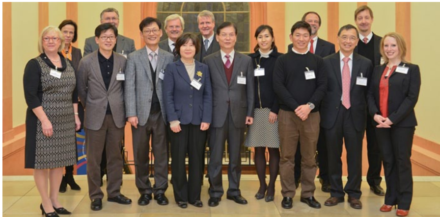
The Korean Scientists in Halle.

In spring last year, the Leopoldina and KAST signed a Memorandum of Understanding, a cooperation agreement, which gives the Leopoldina much better access to one of Asia's leading science locations. KAST is also a key policy advisor of the South Korean government. As part of this agreement, the academies resolved to host a top-level joint science conference on a regular basis. The Founding Conference took place on 25 and 26 November in Halle.