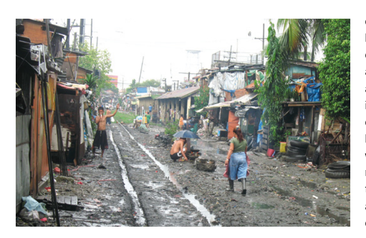
Figure 6: Manila, Philippines. Poor drainage is a frequent problem in Manila's slums, which are constructed parallel to the suburban railway line.

communities and for the inhabitants of surrounding areas. In areas connected to a centralised water supply and waste water disposal infrastructures, a key concern is poor maintenance leading to water loss and waste water leakage. In many parts of the world, the latter contaminates soil and groundwater and may even enter drinking water distribution systems. Along