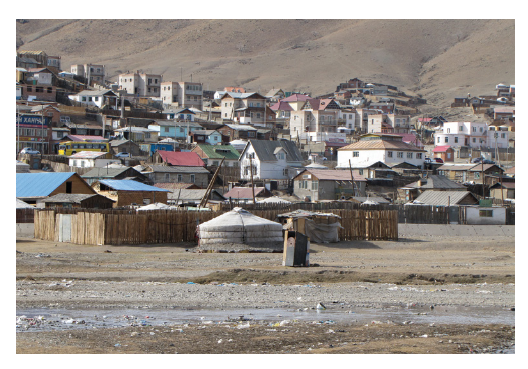
Figure 2: Ulaanbaatar, Mongolia. The banks of the Selbe River are covered with litter. Latrines, such as the one in front of the yurt in the foreground, are often constructed in the floodplains and cause water contamination. This is precarious when surface water is used for drinking.

Although such technologies are currently not considered the state of the art, they have the potential to provide easier access to inexpensive, inclusive and water-saving sanitation. At the same time, decentralisation allows for local decision-making and solutions that are close to local realities. These are more flexible than large-scale infrastructures and allow for stepwise implementation depending on available funds, for example first making sanitation safe from a health perspective and secondly implementing recycling techniques to recover resources and lessen environmental impact. Techniques already available range from low to high tech. For example, pit toilets can be made much safer with simple adaptations that bear almost no additional cost; more complex solutions include in-house water treatment plants or constructed wetlands, which rely on ecosystem services and can be integrated into recreational space for the city. Technological development and cooperation should be targeted towards efficient treatment in densely populated areas, particularly in terms of energy efficiency and recycling of nutrients. Furthermore, an important step forward would be the widespread implementation and testing of available technologies in pilot projects in order to gather more experience of their application on the urban scale.