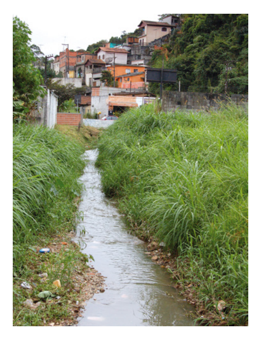
Figure 8: Irregular settlement in Parelheiros district, Municipality of São Paulo, Brazil. Densely-populated peri-urban communities commonly lack access to a public water supply and sewerage systems. The inhabitants discharge their waste water effluents into streams or pit latrines. The exploitation of water wells, which are usually installed in close proximity to these onsite sanitation systems. can induce rapid transport of effluent to drinking water sources.

When environmental and natural resource policies are developed, decision-makers often aim at adopting what is known as existing "best practices". While it generally makes sense to rely on solutions that have proved effective in the past, careful consideration of the specific local conditions is crucial when knowledge is to be transferred. The performance of environmental policies, programmes, strategies and measures crucially depends on the local situation in which they are being embedded. In the case of water-related issues, it is eminently relevant when designing and implementing policies and measures to define the capacity and functioning of ecosystems and to specify the societal demands and affordances. Moreover, it is important to take into account the managerial and distribu-