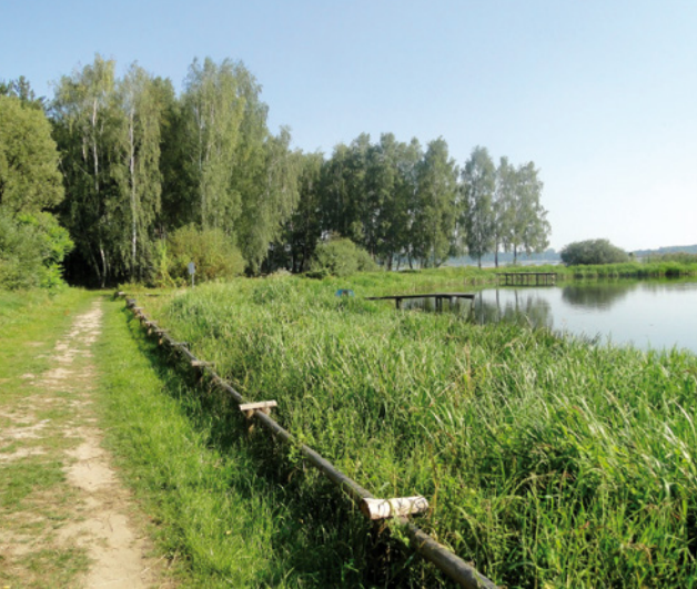
Figure 3: Sulejowski Reservoir, Poland. Restoration of plant riparian zone for buffering the non-point source pollution from agricultural land, combined with establishing of denitrification wall under the road, action funded by EU Project Life+ EKOROB.